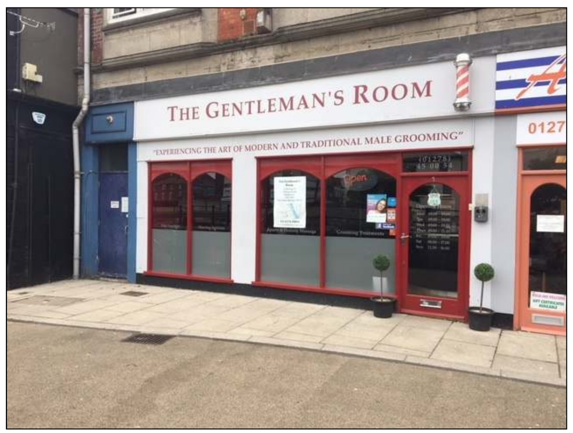
Unit 1 Fishermans Wharf, Bridgwater, Somerset, TA6 3HL.